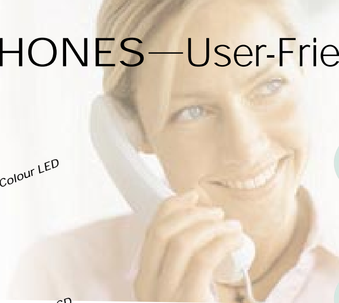
Dual Colour LED